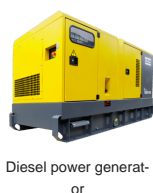
Diesel power generator