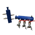
Water supply connection