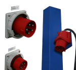
Electrical power connection (A)