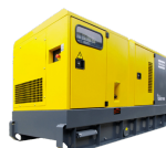
Diesel power generator