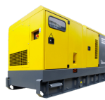
Diesel power generator