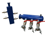
Water supply connection