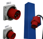
Electrical power connection (A)