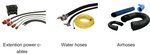
Extension power cables