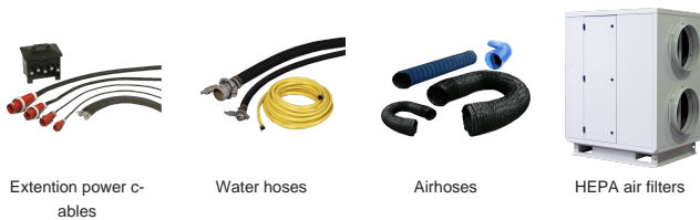
Extension power cables