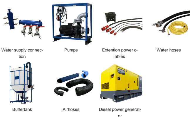
Water supply connection