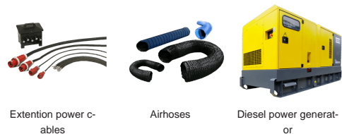
Extention power cables