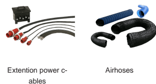
Extention power cables